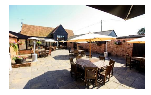
Little Channels - The Courtyard Suite