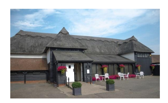
Channels - The Essex Barn

With ample free parking, beautiful patio's and private courtyards, Channels and Little Channels are the perfect venues when booking a conference.